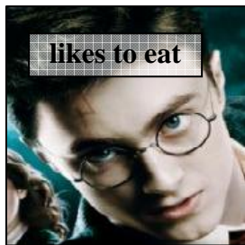
Example of one side of dice 1